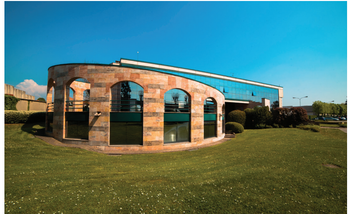
Parà's Sovico headquarters