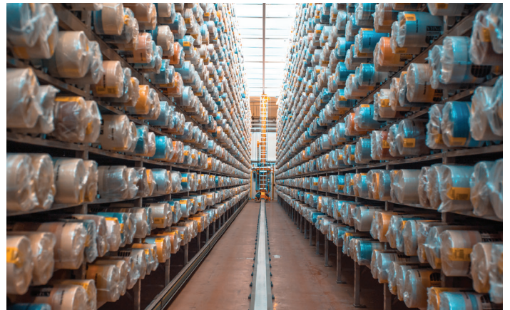
Parà's robotic warehouse